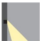
Ext-Wall Recessed Downlight