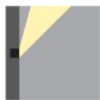
Ext-Wall Recessed Uplight