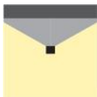
Suspended 3 sides