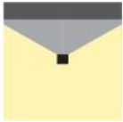
Suspended 3 sides