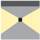
Suspended 2 sides