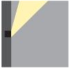
Ext-Wall Recessed Uplight