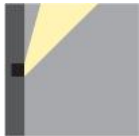
Ext-Wall Recessed Uplight