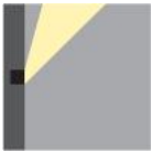
Ext-Wall Recessed Uplight