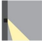
Ext-Wall Recessed Downlight