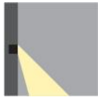
Ext-Wall Recessed Downlight