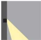
Ext-Wall Recessed Downlight