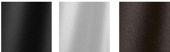
Black Metallic Textured Silver Metallic Textured Bronze Metallic Textured